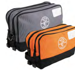
Double Zipper Tool Bag, 2-Pk 55579