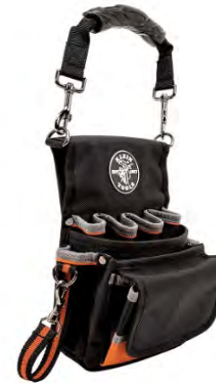
Tradesman Pro Tool Pouch 5242