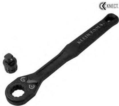
KNECT (M) Pass Through Ratchet Socket Adapter 65408ADP