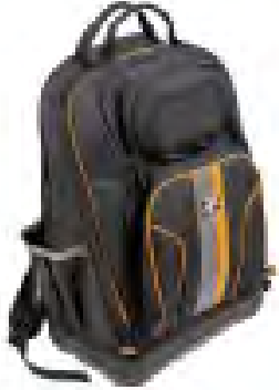
Tradesman Pro XL Tool Bag 62800BP